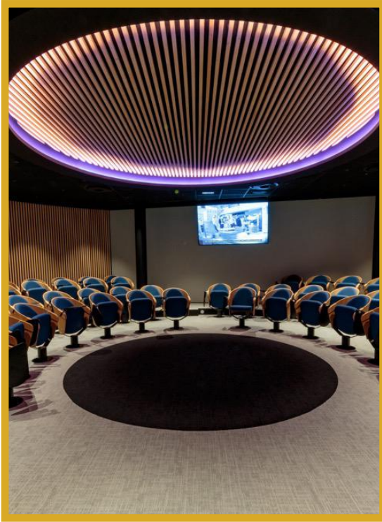
aivancity is a hybrid school built around the triptych Technology, Business and Ethics.

Its mission is to prepare future «Algeeners®» capable of responding to the many challenges facing the economy and society as a whole, as we harness the potential of data and artificial intelligence: graduates capable of developing IT programs to accelerate business performance and ensure the transition to Industry 4.0, but also of working towards the progress of humanity, in all fields, while ensuring that ethical rules evolve in line with technical and societal developments.